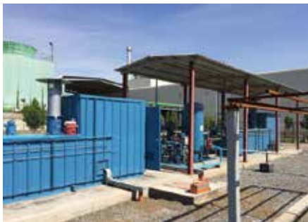
90 MMBTU / hr x 2 - SNG System - Sohar Steel - Sohar - Oman