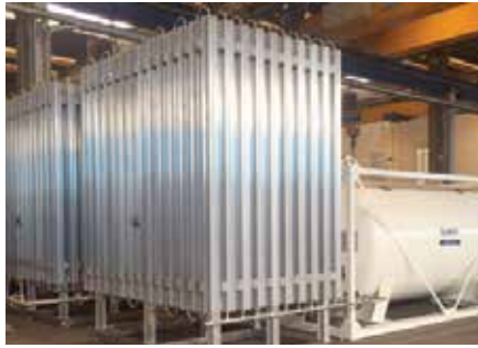
7.5 m3 - Nitrogen Generating Skid - ADGAS - Abu Dhabi, UAE