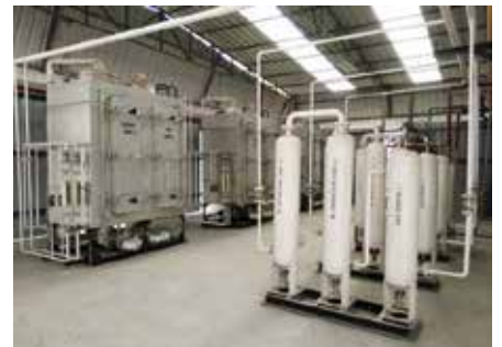
90 Nm3/hr Hydrogen Generation Plant Gold Plus Glass Industry, Roorkee, India