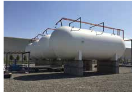
110 m3 x 4 - LPG Storage - Sohar Steel - Sohar - Oman