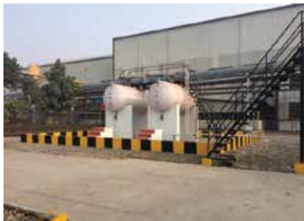
2 x 10m3 - Ammonia Storage & Regassification System - Gold Plus Glass Industry, Roorkee, India