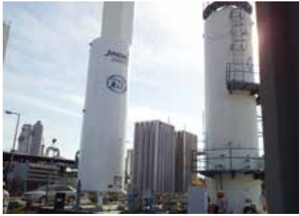
45 KL LAR Storage + 70 M3 Argon Buffer - Jindal Shadeed - Sohar - Oman